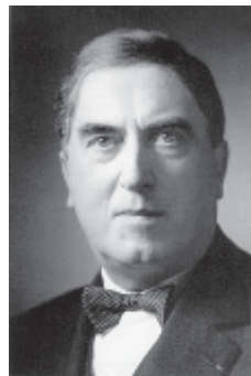
Maurice Durufle, c. 1962

We are seeking dedicated singers interested in performing this choral masterpiece. Rehearsals will be from 7 to 9 p.m. Tuesdays starting January 19. To register to sing in this ensemble or for information, please contact me at the Cathedral office (727-822-4173, ext. 115) or e-mail me at dthomas@spcathedral.com.