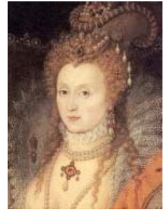
Elizabeth Tudor, second head of our Church

The class is open to all adults and older teens. It runs Sundays from September 20 through December 13.