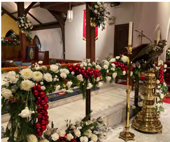
The Cathedral dressed for Christmas 2021.