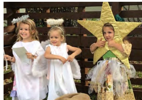
Little angels in the manger at the live nativity.