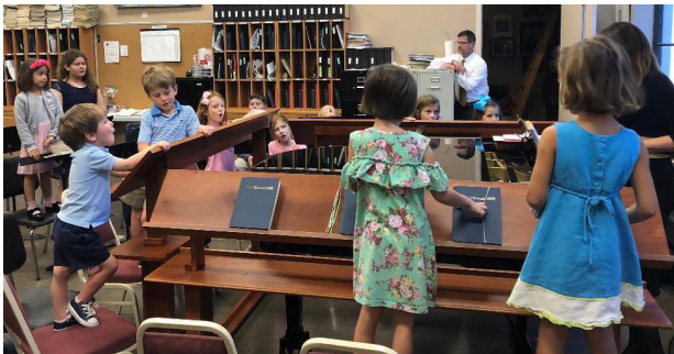
Members of St. Peter's first Christmas pageant choir rehearse for the big day on Sunday, December 16.

If you have sheep, angel, shepherd, or other costumes or props to donate, please contact children's minister Hillary Peete ( hpeete@spcathedral.com ).