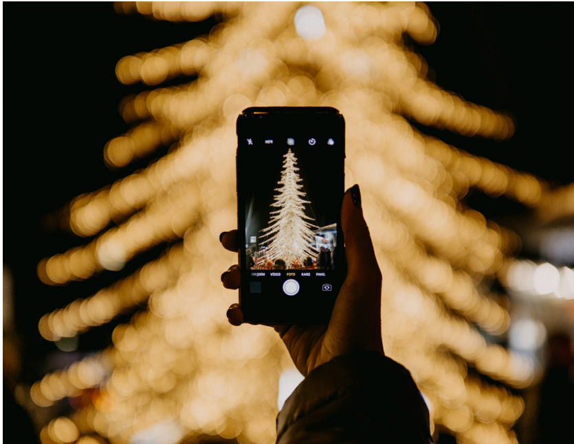
Anticipating Christmas: What Advent is all about.

At the foot of the cross in downtown St. Petersburg